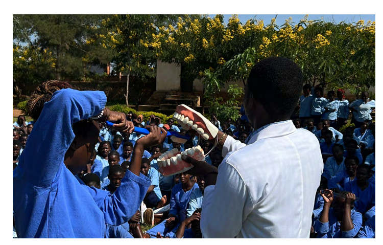
Oral hygiene instructions for the women